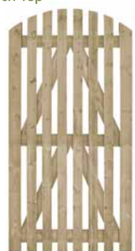
The Picket Arch Top

This is a traditional frame ledge and brace arched top palisade gate, suitable for any style of property.