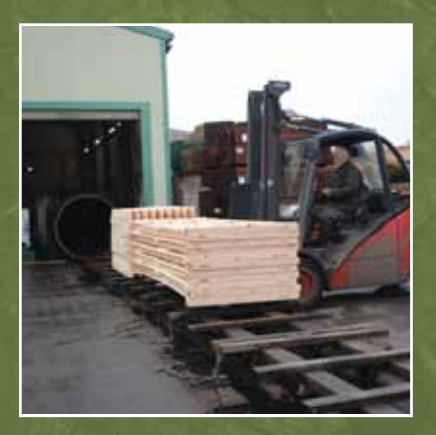
Pressure treatment of timber is carried out on site at Linnell Bros.