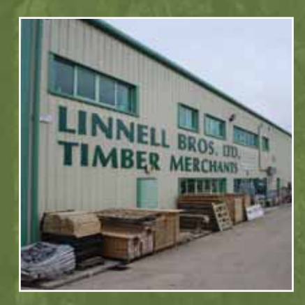
Workshops, offices and a well-stocked shop – all under one roof

Over the years, Linnell Bros. has diversified to offer a complete range of timber products, many of which