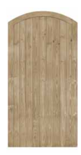
The Abbey Gate

The Abbey is a very attractive and stylish tongue & groove boarded gate with a shallow curved top, to enhance any stlye of property.