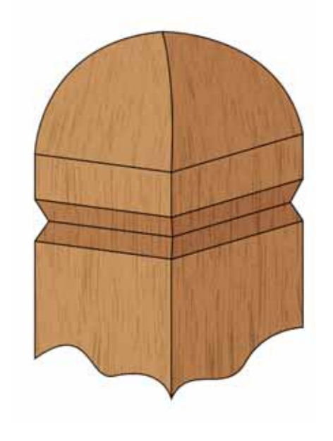
4 x Weathered top with square edge throating