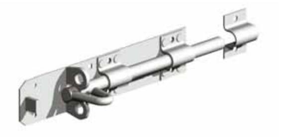
Padbolts and brenton bolts for all styles of gate