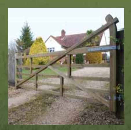
The Evenley Double Braced Gate.

In addition to our softwood gates, we can also offer Malaysian hardwood gates in this range.